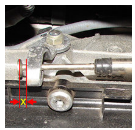
With the emergency cable released the clearance X indicated above must be adjusted to 1.0 to 2.0 mm.